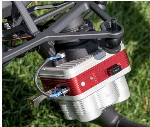
Fully connected Quick Mount Gen. 2