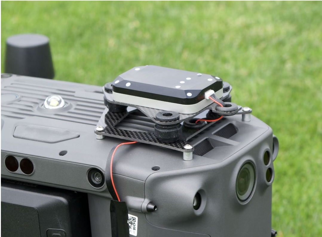
Fig. 1: DLS 2 mounted on M300 RTK

Warning: Before any flight, always be sure to check the DLS2 and any other mounted components are secure. Screws and cable ties can loosen over time due to wind and vibration during flights. The included Loctite threadlocker helps to avoid this, but it is not foolproof. Always do a pre-flight safety check!