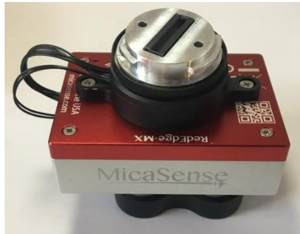
Quick Mount Gen 2 Adapter attached to RedEdge-MX