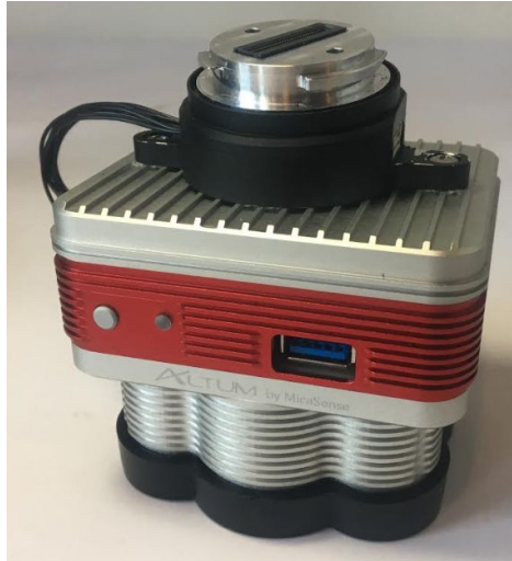
Fully connected Quick Mount Gen. 2