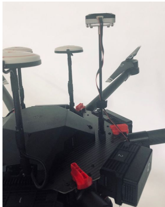
DLS2 Mounted on a Matrice 600Pro