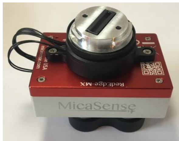
Quick Mount Gen 2 Adapter attached to RedEdge-MX