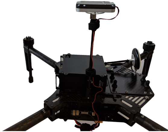
DLS2 Mounted on Matrice 100