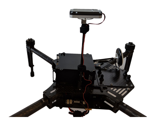
DLS2 Mounted on Matrice 100