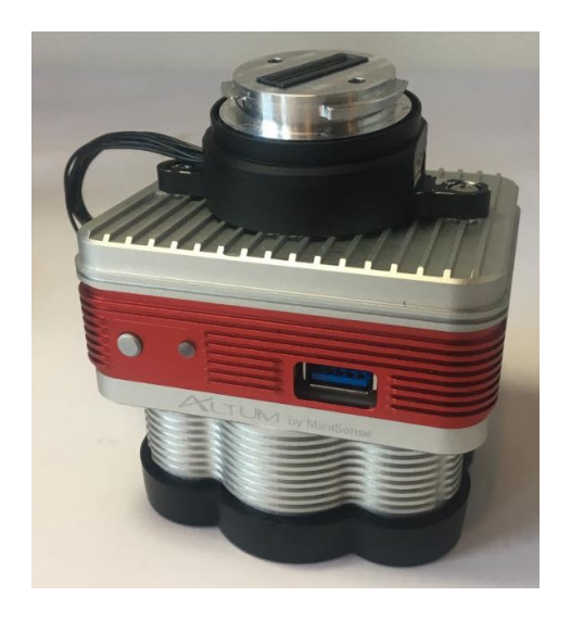
Fully connected Quick Mount Gen. 2

Connect the provided Altum Gen. 2 Quick Mount cable to the "HOST" port found on the Altum camera and the Power/Trigger and Communication ports found on the Quick Mount.