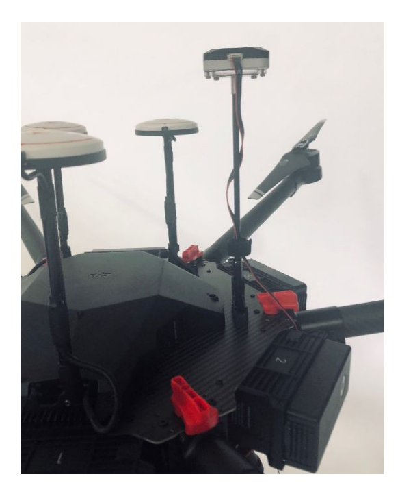
DLS2 Mounted on a Matrice 600Pro