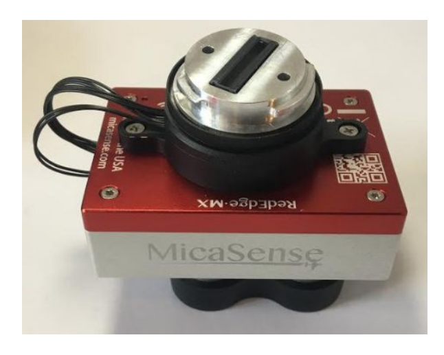
Quick Mount Gen 2 Adapter attached to RedEdge-MX